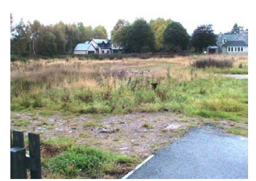
Fig. 2: Proposed site, looking east towards Tigh na Fraoch (right)