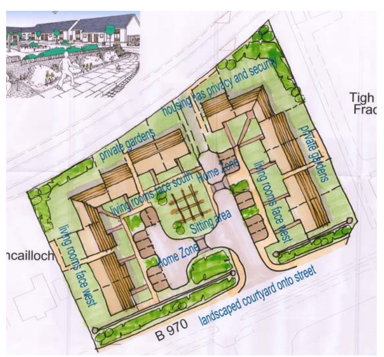
Fig. 4: Proposed indicative site layout

only and the applicants would be prepared to accept a condition regarding design stipulations, front elevations, ridgelines, orientation etc. in the event of consideration being given to the granting of planning permission.