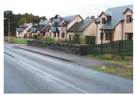
Fig. 3: Existing properties immediately west of proposed site

3. Although this is an application for outline permission, an indicative site layout plan together with an artists impression of the development has been submitted. The 13 dwelling units are shown as single storey structures arranged in linked groups, arranged in a U shape around a central courtyard area, which is intended to serve as open space (identified as a 'sitting area'). Provision is also made for 16 car parking bays. Access to the site is proposed from a single vehicular access point off the public road. The U shape is created by positioning housing units positioned perpendicular to the public road on the western and eastern areas of the site, and completed by houses running parallel to the road from north to south towards the rear of the land. The artists impression shows the houses having a render finish, combined with vertical timber detailing in selected areas. applicants agents have emphasised in communications in the course of the application process that the layouts and drawings are indicative