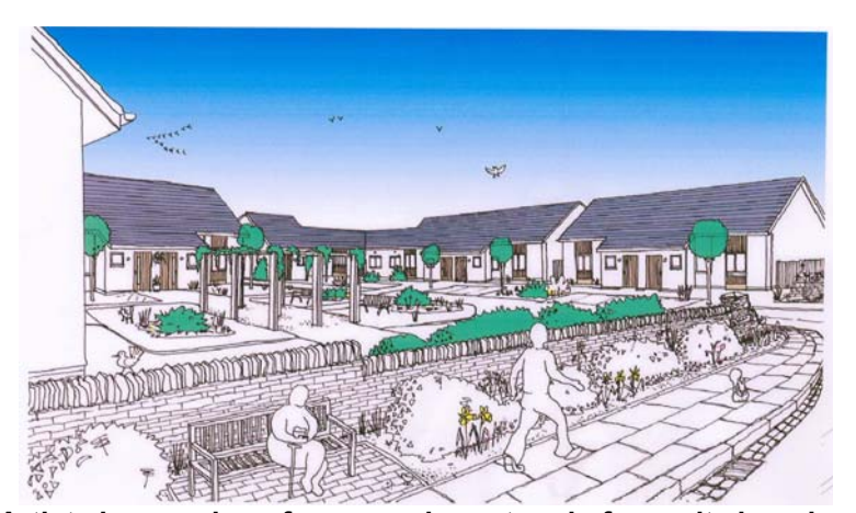
Fig. 5: Artists impression of proposed courtyard of amenity housing

4. The development is proposed to connect to the public water supply and foul drainage would be disposed of by a connection to the public sewer. Surface water is also proposed to be disposed of by a connection to a public drain.